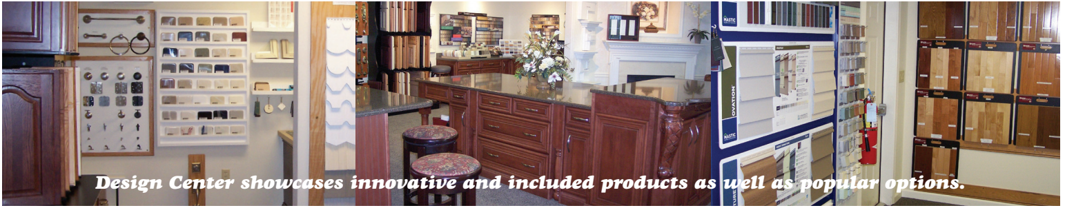
Design Center showcases innovative and included products as well as popular options.