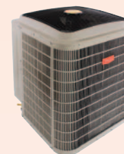
Model 280ANV Variable Speed Heat Pump

One of the worlds most efficient and quiet heat pumps, delivering reliable cost saving comfort with more features.