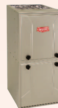
Model 987MA Variable-Speed, Fully Modulating, Condensing Gas Furnace