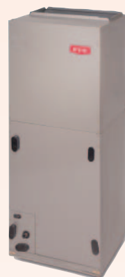
Model FE4A Communicating Fan Coil