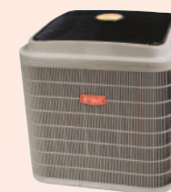
Model 286BNA Two-Stage Heat Pump

HYBRIDHEAT™ With today's volatile utility costs, Hybrid Heat Systems deliver exceptional performance utilizing multiple energy sources, delivering maximum comfort & economy.