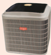
Model 225BNA Heat Pump with FV Fan Coil