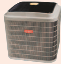
Model 225BNA Heat Pump with FV Fan Coil