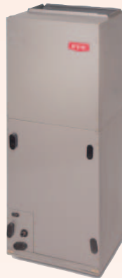
Model FV4B Variable Speed Fan Coil