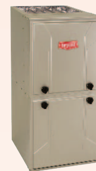
Model 987MA Variable-Speed, Fully Modulating, Condensing Gas Furnace