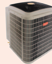
Model 280ANV Variable Speed Heat Pump

One of the worlds most efficient and quiet heat pumps, delivering reliable cost saving comfort with more features.