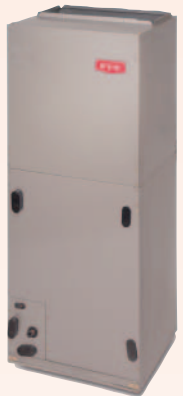
Model FV4B Variable Speed Fan Coil