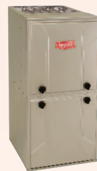
Model 987MA Variable-Speed, Fully Modulating, Condensing Gas Furnace