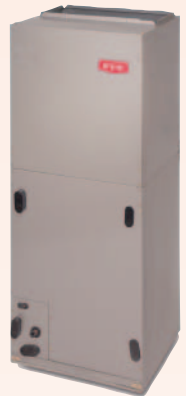
Model FV4B Variable Speed Fan Coil