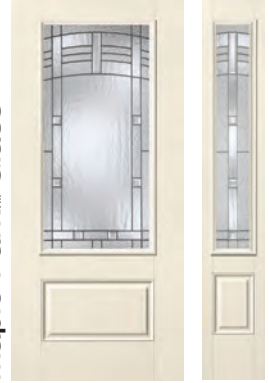
Maple Park™ Glass