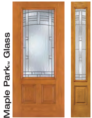
Maple Park™ Glass