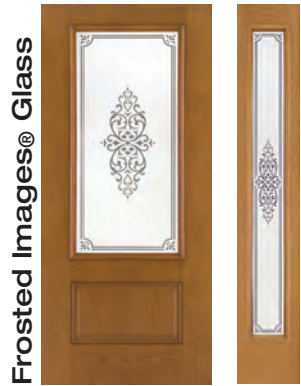
Frosted Images® Glass