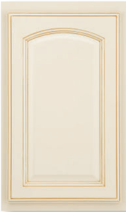
BRINKLEY Available in: Maple Door Style: Arch raised panel Clayton door used on 9" wall and base cabinets Overlay: Half