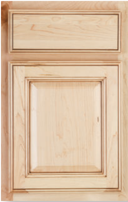
CLAYTON Available in: Oak, Maple Door Style: Raised panel Overlay: Half