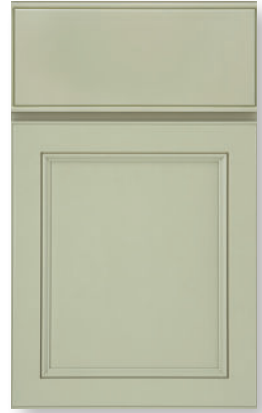
JENNINGS Available in: Maple Door Style: Recessed panel Overlay: Full