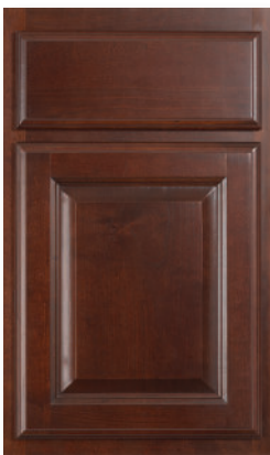
CLAYTON Available in: Cherry Door Style: Raised panel Overlay: Half