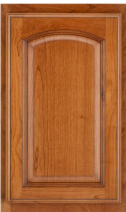
BRINKLEY Available in: Cherry Door Style: Arch raised panel Overlay: Half