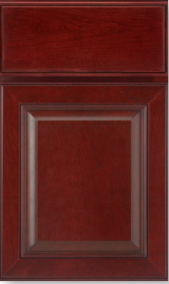
RILEY Available in: Cherry Door Style: Raised panel Overlay: Full