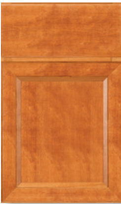
EVERETT Available in: Maple Door Style: Recessed panel Overlay: Full