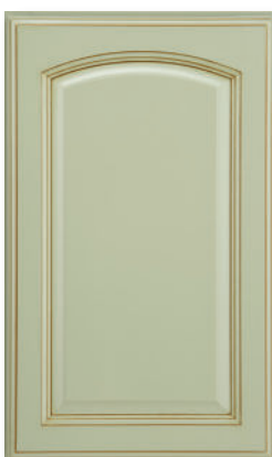
CULLEN Available in: Cherry, Maple, Knotty Alder, Hickory Door Style: Raised panel Fillmore door used on base cabinets Overlay: Full