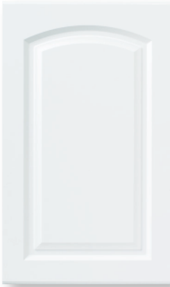
GILFORD Available in: Thermofoil Door Style: Five-piece raised panel Andover door used on base cabinets Overlay: Full