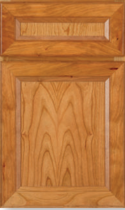
EVERETT Available in: Cherry Door Style: Recessed panel Overlay: Full