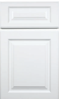
ANDOVER Available in: Thermofoil Door Style: Five-piece raised panel Overlay: Full