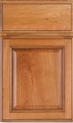
FILLMORE Available in: Cherry, Maple, Knotty Alder, Hickory Door Style: Raised panel Overlay: Full