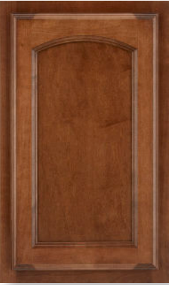
KEELER Available in: Oak, Maple Door Style: Flat panel Freemont door used on 9" wall and base cabinets Overlay: Half