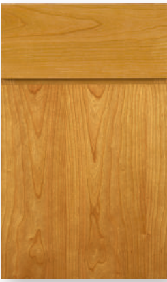
LENNON Available in: Cherry, Maple, Hickory, Oak Door Style: 3/4" engineered material, edge banded Overlay: Full