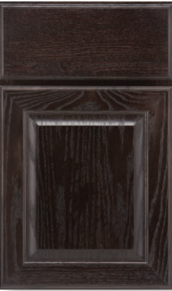
COURTLAND Available in: Oak Door Style: Raised panel Overlay: Full