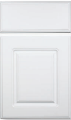
TRENTON Available in: Thermofoil Door Style: Five-piece raised panel Overlay: Full

With nearly a century of experience crafting quality cabinetry, we understand the importance of workmanship, style and functionality. Create a room that is uniquely yours by choosing from a wide variety of door styles. Five levels of finishes are available; some are an upgrade depending on the door style and wood species selected.