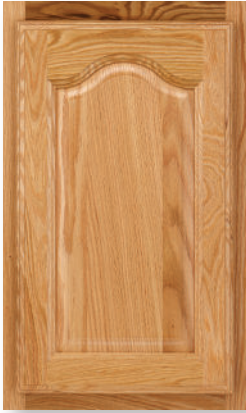
PIEDMONT Available in: Oak Door Style: Raised panel Clayton door used on 9" wall and base cabinets Overlay: Half