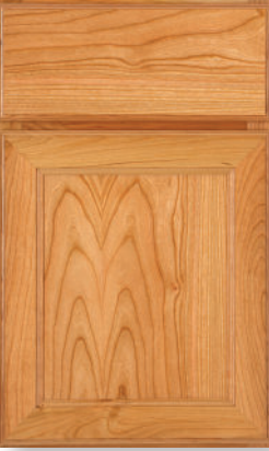
WEBBER Available in: Cherry Door Style: Recessed panel Overlay: Full