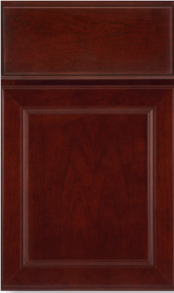
JENNINGS Available in: Cherry Door Style: Recessed panel Overlay: Full