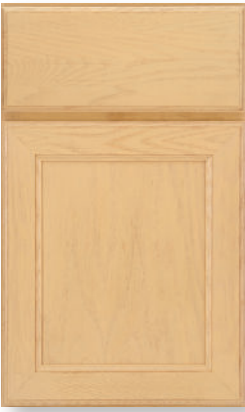
WEBBER Available in: Oak, Maple Door Style: Recessed panel Overlay: Full