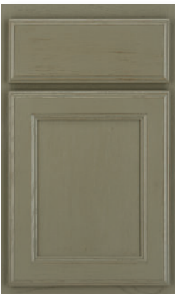
FREEMONT Available in: Oak, Maple Door Style: Recessed panel Overlay: Half