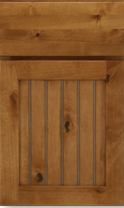
EVELYN Available in: Knotty Alder, Maple, Oak, Thermofoil Door Style: Beaded panel Overlay: Full