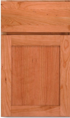
HENNING Available in: Cherry, Maple, Knotty Alder, Hickory, Oak Door Style: Recessed panel Overlay: Full