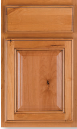
WILDER Available in: Knotty Alder Door Style: Raised panel Overlay: Half